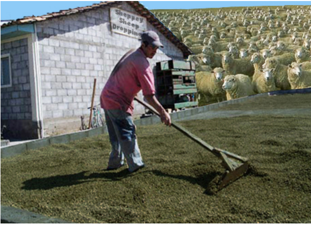
Sheep droppings were collected and air dried as soon as a sunny day occurred on Sheppey.