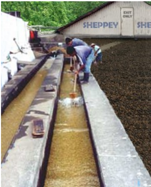
The droppings were then expertly washed by highly trained and diligent workers. The workers were known as ' Wiffy Washers '.