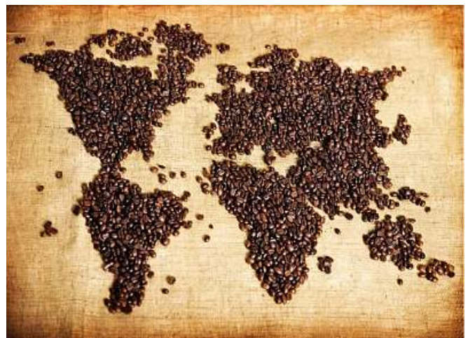
According to the man in the pub, sheep droppings were sent all over the world. However, we do not know how many people ate them ...or if anyone ever ate them at all!