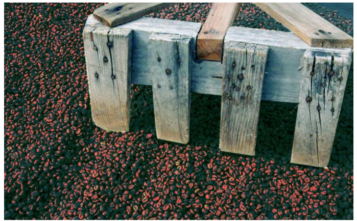
The droppings were frequently 'turned' using a cheap old wooden rake.