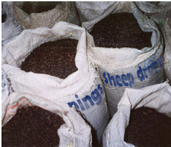
When dry, the droppings were then put in sacks by trained ' Poo Packers ' ready for distribution to the waiting public.